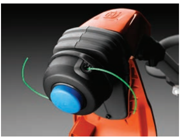
TAP 'N GO TRIMMER HEAD